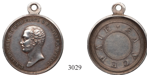
3029 Medal for Zeal. Silver. 29 mm. By R. Ganneman . Bit 872.A (R1), Diakov 637.4 (R3), Sm 560/b. Alexander II head l., П.Г. on truncation / Legend: “ЗА УСЕРАДІЕ” – “For Zeal” around, braided inner circle, quadruple band outer. Very rare.

Condition: Tooling and smoothing in fields. Very fine $ 15,000 Ex Gorny & Mosch “Russland”, Auktion 162, München, 10 Oct. 2007, lot 7204