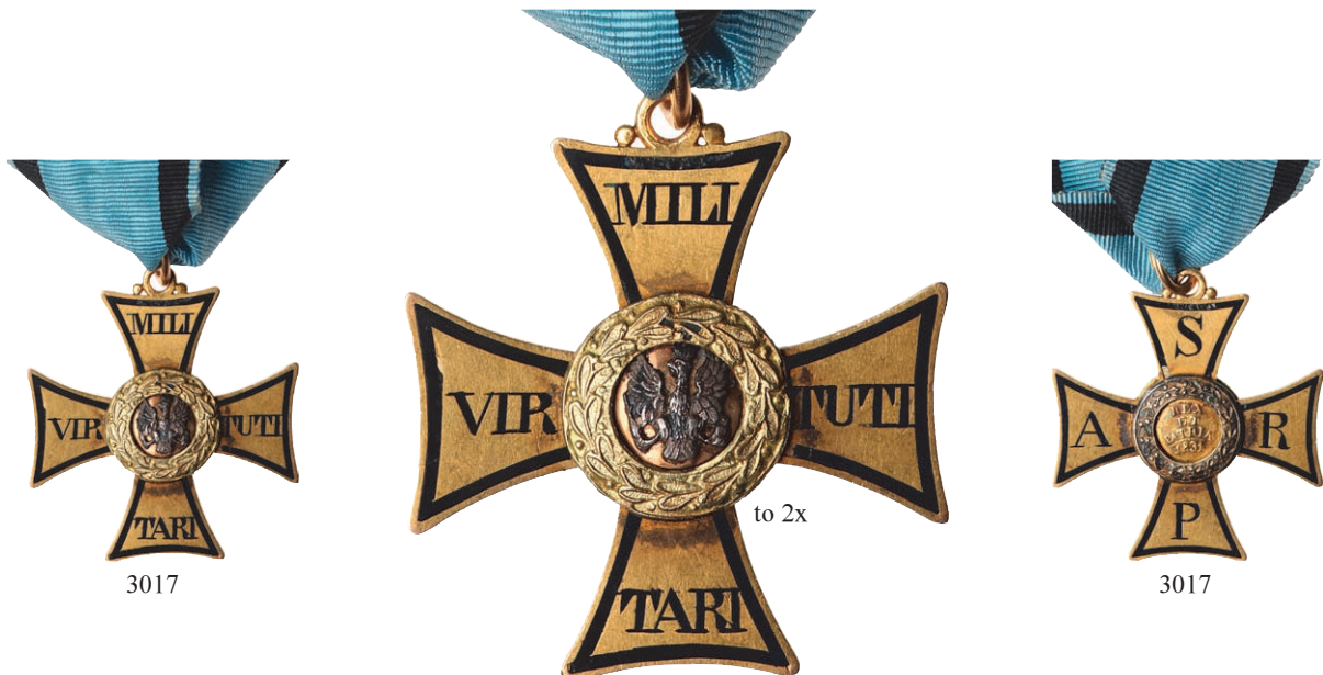
3017 Cross. 4 th Class. Gold and black enamel. 34 mm. St. Petersburg, 1831. Hallmarked with St. Petersburg assayer mark on a ring. Detailed Polish eagle surrounded by wreath. VIR – TUTI, MILI-TARI set in black enamel on arms. REX / AT / PATRIA / 1831 in center medallion on reverse. Rare.