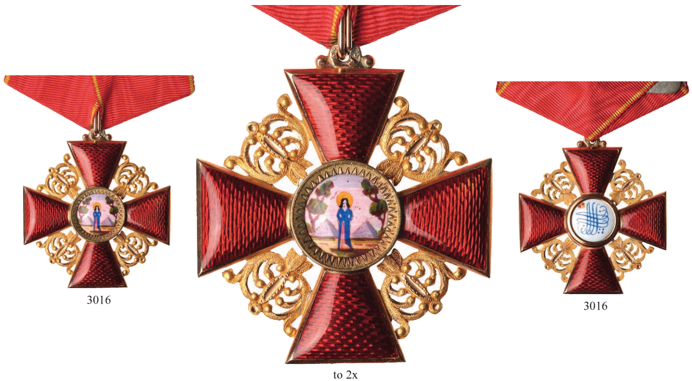
3016 Cross. 3 rd Class. Civil Division. Gold and enamels. 39 mm. Ca. 1860's-1870's. Multi-color Saint at center between two pyramids, and trees in background, red-enameled cross. Hallmarked "(head) 56" on loop. On ribbon. A magnificent premium early cross.