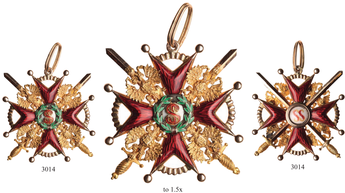
3014 Cross. 3 rd Class. Military Division. Gold and enamels. 44 mm. After 1908. 56 (14K), makers mark "BA" and St. Petersburg assay mark on a loop. Magnificent workmanship with double-sided enamel. So called "bomb"-type.