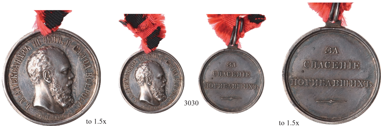
3030 Award Medal for Life Saving. Silver. 29 mm. By L. Steinman . Bit 1053 (R2), Diakov 901.5, Sm 836/b. Alexander III head r., signed by Steinman below / Three-line legend. On ribbon. Very rare.

Condition: Steely gray with very light iridescent hues. Choice about uncirculated $ 750